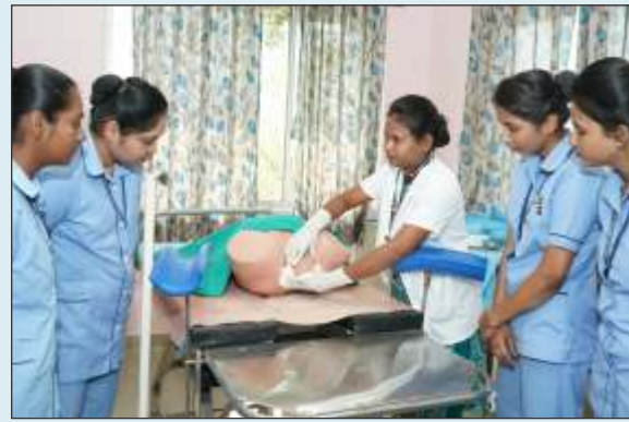
OBSTETRICS AND GYNAECOLOGY NURSING LAB