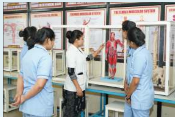
PRE CLINICAL LAB