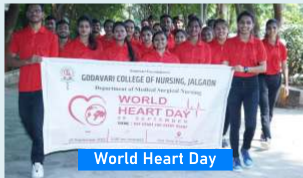
World Heart Day