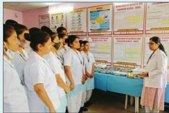
CHILD HEALTH NURSING LAB