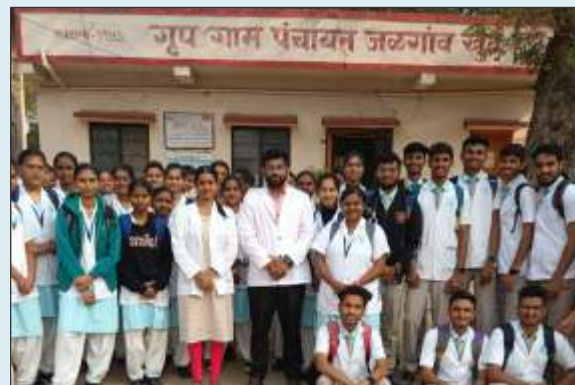
COMMUNITY HEALTH NURSING LAB