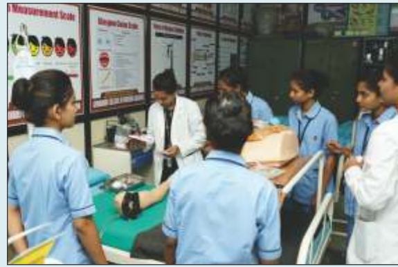
NURSING FOUNDATION INCLUDING ADULT HEALTH NURSING & ADVANCED NURSING LAB