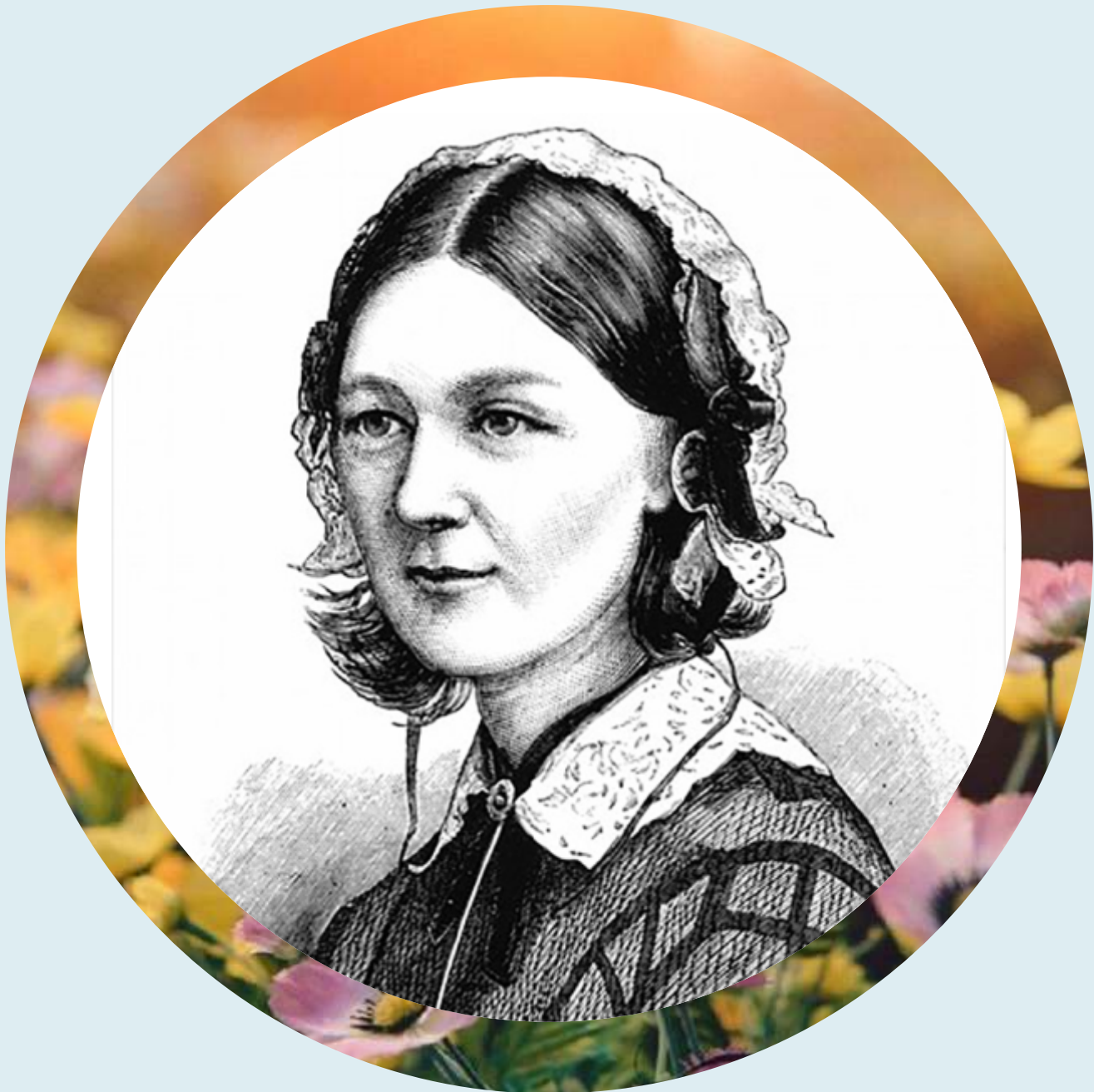
FLORENCE 1820-1910 NIGHTINGALE