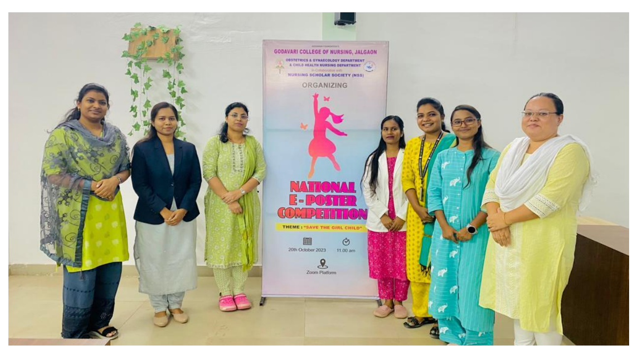
ORGANISING COMMITTEE MEMBER