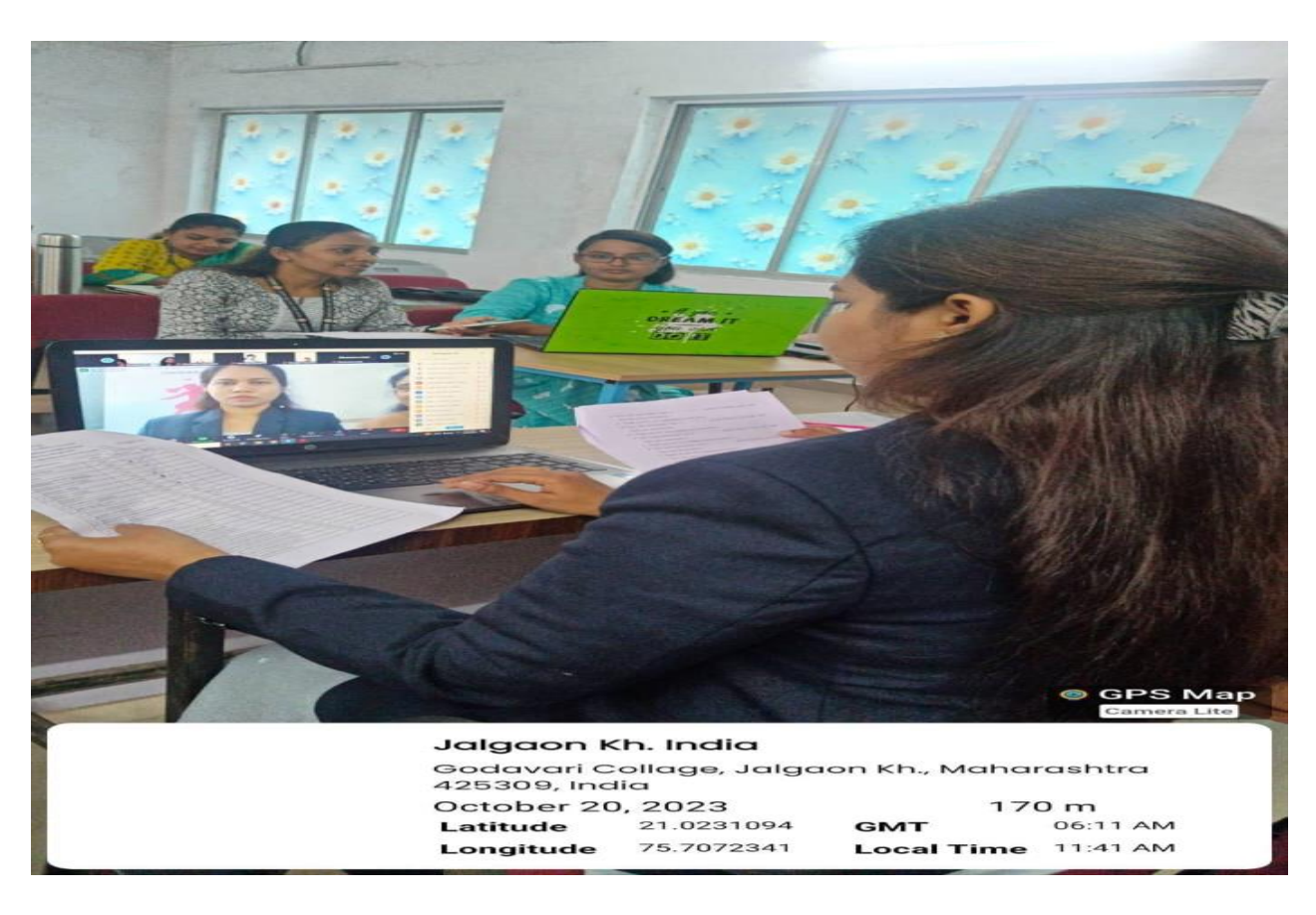
TECHNICAL ASSISTANCE COMMITEE