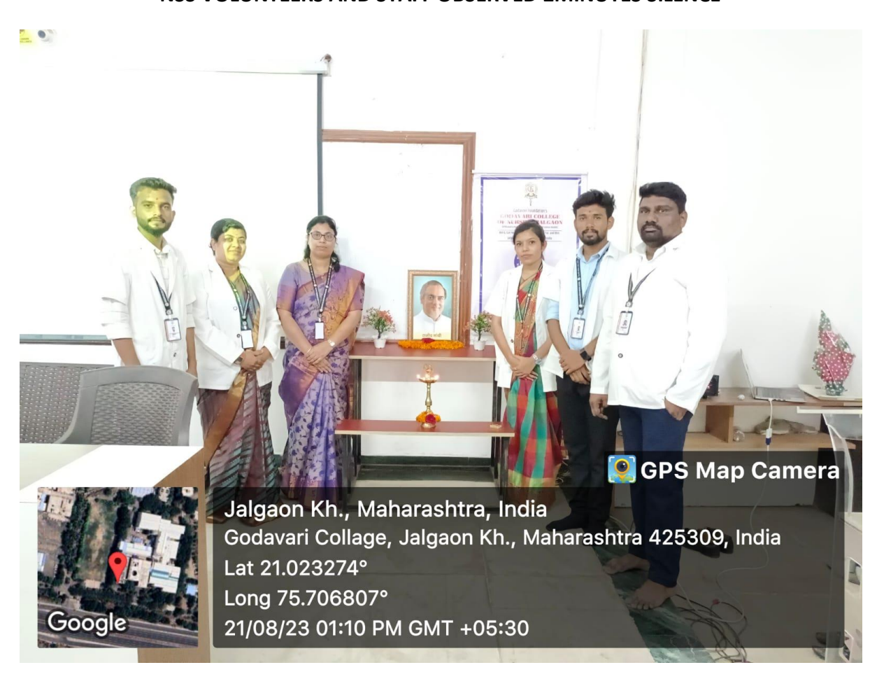
NSS PROGRAM OFFICERS