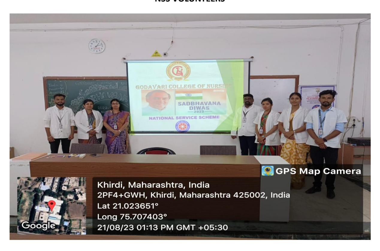
NSS PROGRAM OFFICERS