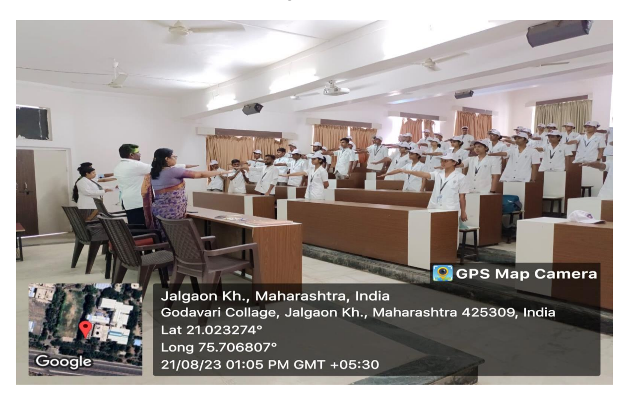
NSS VOLUNTEERS TAKING PLEDGE